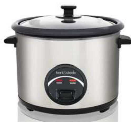
Rice Cooker model TS5